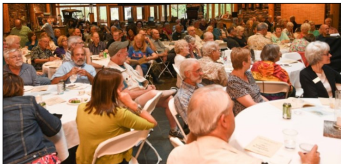
Volunteer Recognition Event