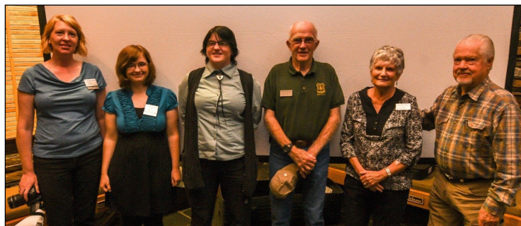
Volunteer Recognition Event