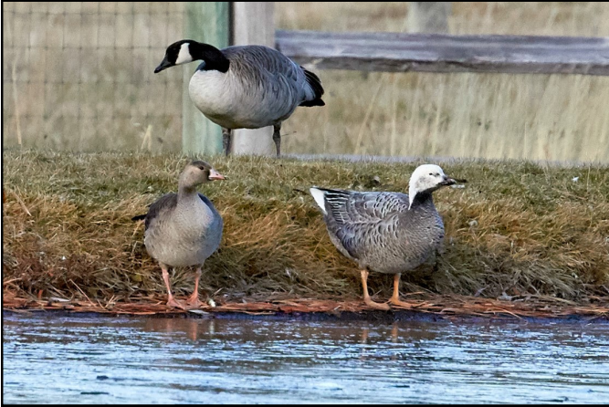
Pictured on the top - Canada goose, on the left - greater white-fronted goose, and on the right - emperor goose.

Pulsing, pounding, pulsating winds drove waves at the Oregon coast to high crests. Waves of horizontal rain on the pass brought no snow but large amounts of water. In winter these storms bring out the birders. Good experienced birders know the stormy weather birder catches the rarities.