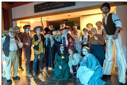
Tales of Hallows Eve