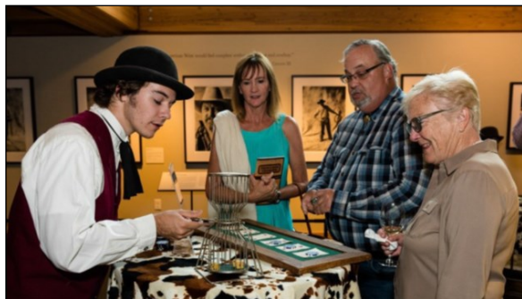
High Desert Rendezvous