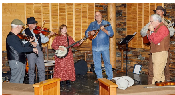
Thorn Hollow String Band