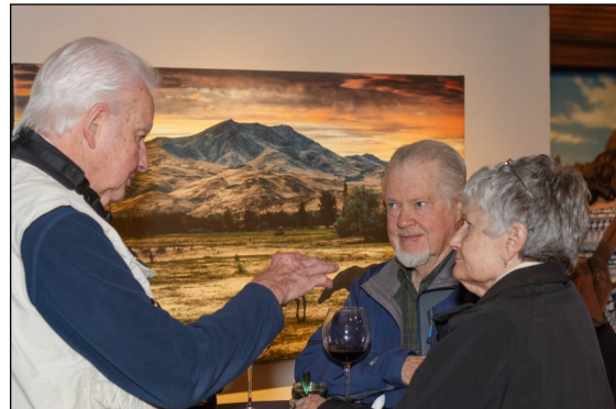
HDM: After Hours