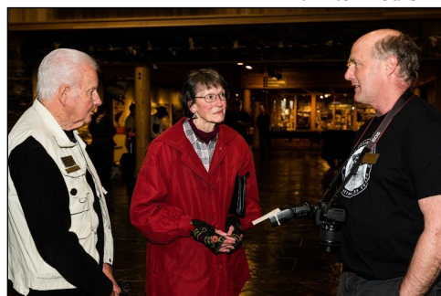
High Desert Museum 35th Anniversary