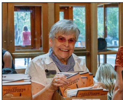
High Desert Rendezvous