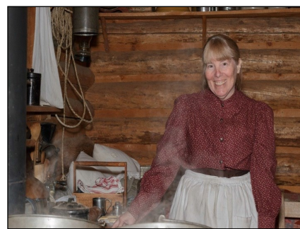
High Desert Museum 35th Anniversary