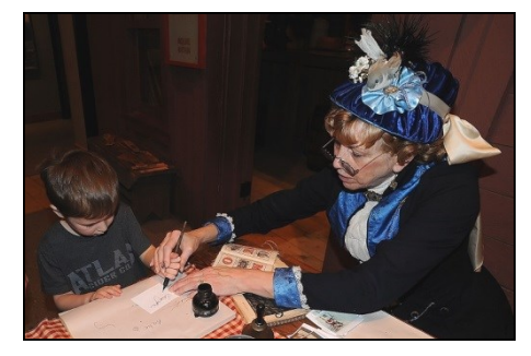
Spirit of the West Day