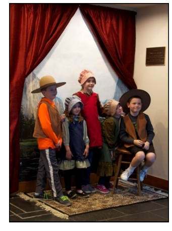
Growing Up Western