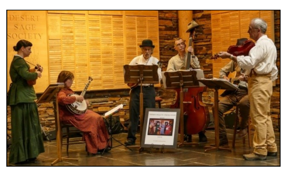
Picnic in the Past