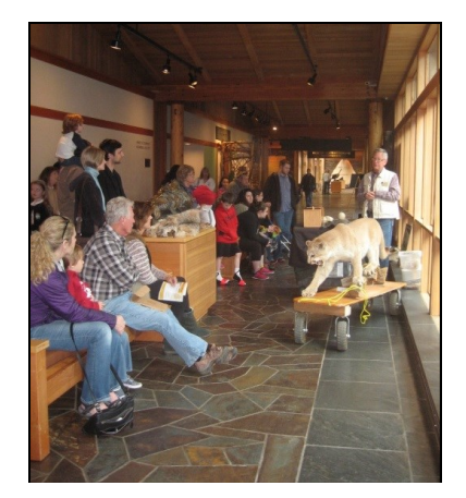
Mammal Team Presentation