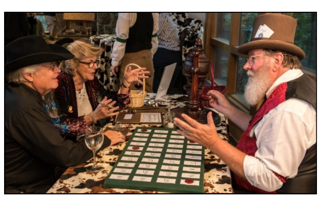
High Desert Rendezvous