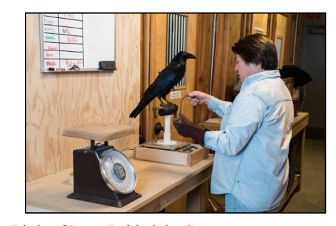
Birds of Prey Behind the Scenes