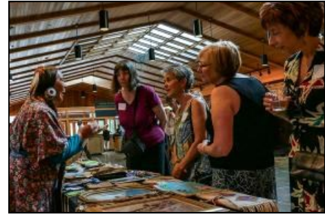
Art of the West