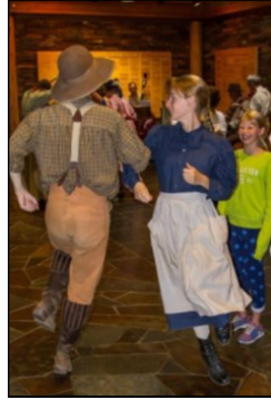
Picnic in the Past