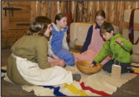
Spirit of the West Day