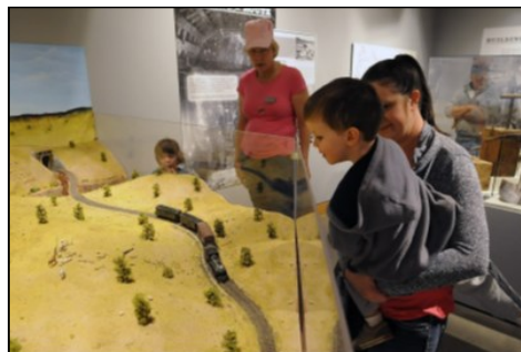
All Aboard! Railroads in the High Desert