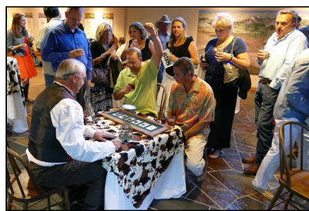
High Desert Rendezvous