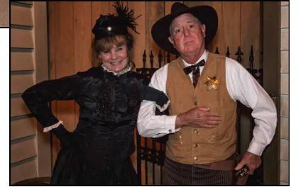
Firearms & Fashion