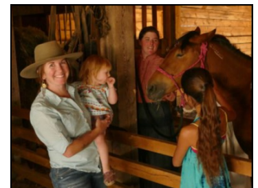
Mustang Awareness Day