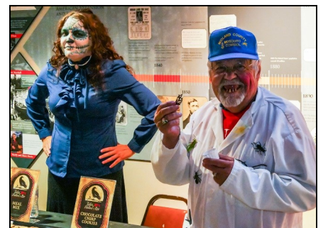
Tales of Hallow's Eve