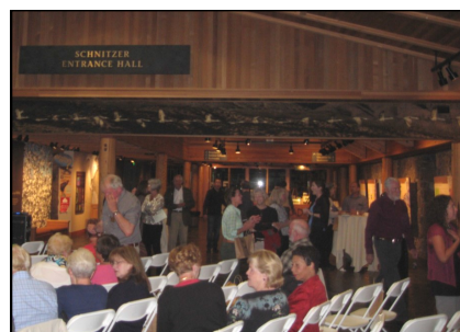
Annual Meeting & Volunteer Recognition