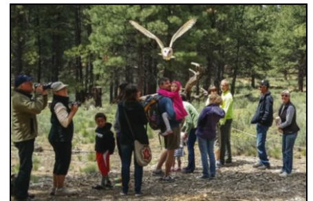
Raptors of the Desert Sky