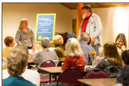
All Volunteer Meeting and BBQ