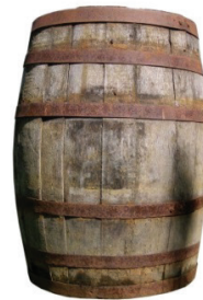
Barrel of Flour