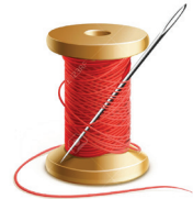
Tailor or Seamstress