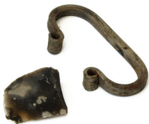
Flint and Steel