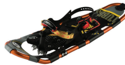
Plastic and Metal Snowshoes