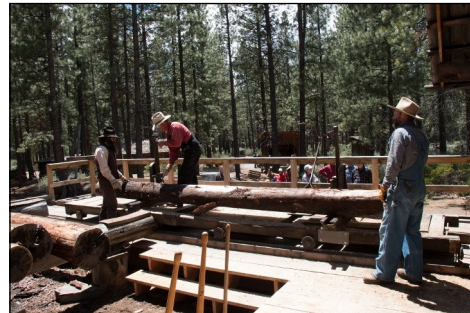
Lazinka Sawmill Demonstration