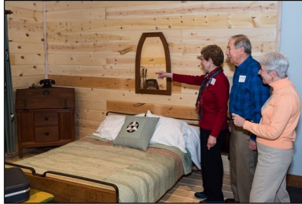
Art for a Nation exhibit