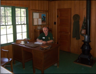
High Desert Ranger Station