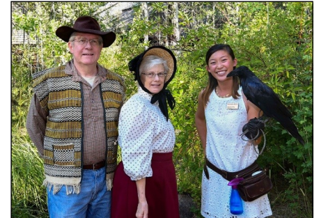
High Desert Rendezvous