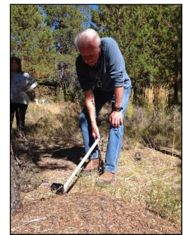
Photographing ants in the wild