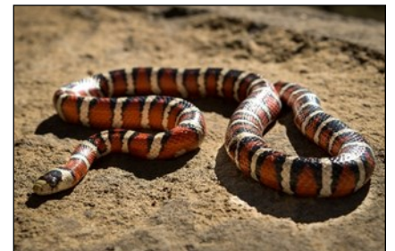
Sonoran Mountain Kingsnake