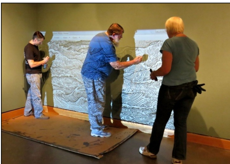
Buzzsaw Sharks of Long Ago exhibit