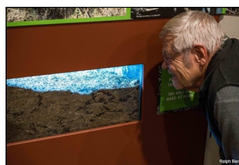
Hidden Life of Ants exhibit