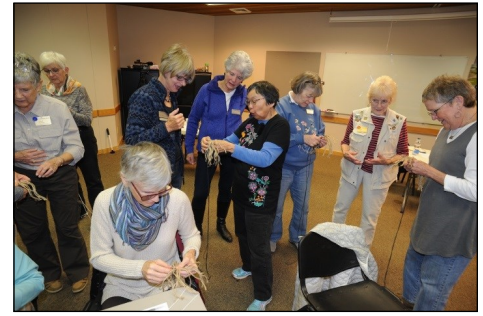
Making Sally Bags