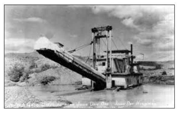
Gold dredge.

Sumpter - Gold was discovered in 1862 when five men from South Carolina, on their way to California, camped near Cracker Creek in the Blue Mountains. They discovered gold while panning the gravels along the creek. They decided to stay and work the area rather than continuing to California. They built a small cabin between Cracker Creek and McCully Creek and named it Fort Sumter (remains of the cabin can still be seen today). The name of the town was changed from Sumter to Sumpter in 1883 when the Post Office was established to avoid confusion for mail delivery. During this time, placer mining was most common in gold-bearing gravel in streams. Hard rock mining began about 1895 with the invention of the