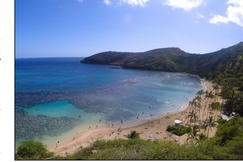
Hanauma Bay, HI.

Fast forward to today. Bend seems to have quite a connection with Hawaii. Maybe it's partly because the city is also in an area shadowed by volcanoes. Here in Bend, there are two Hawaiian restaurants (owned by former residents of Hawaii) and three Hawaiian food trucks. One of the food