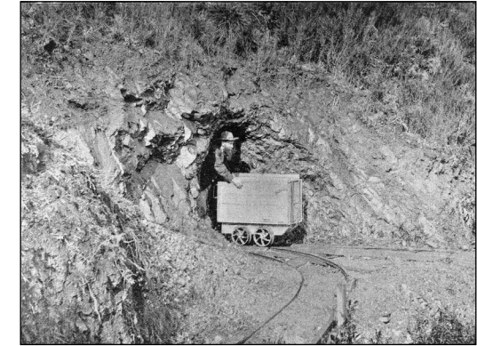
Lode mining. File photo

Canyon City - Gold was discovered in Canyon Creek in the Blue Mountains on June 7, 1862 by some gold seekers who camped along Canyon Creek. Some say that they were searching for the mythical Lost Oregon Blue Bucket Mine near the head waters of the Malheur River (1845). News of their discovery spread rapidly and within a month 300 miners staked claims in the area. Whiskey Gulch and Canyon Creek were estimated to have some of the highest concentrations of gold in the whole state of Oregon. At one time, as many as 10,000 people lived along Whiskey Gulch Street in Canyon City, crowded with businesses, which provided for the rapidly growing settlement. The discovery of gold led to land between Canyon City and John Day being valued at $500 per square yard. Panning for gold