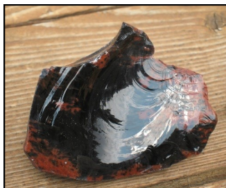
Obsidian from Glass Butte, East of Bend