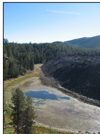
Big Obsidian Flow

To see a 30-second video of a 3D model of the magma chamber structure and learn more about the project, go to http://pages.uoregon.edu/emilie/WebPage/Research.html and click on the link to the Newberry Volcano Magma System.